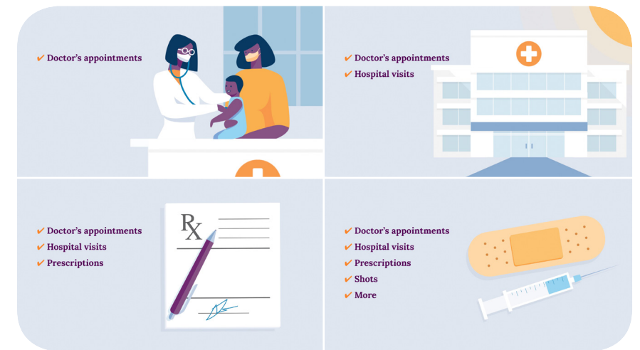
SUPER: (builds) Doctor's appointments, Hospital visits, Prescriptions, Shots, More We quickly transition through scenes illustrating the talking points. VO: Get peace of mind knowing that doctor's appointments, hospital visits, prescriptions, shots, and more are covered.