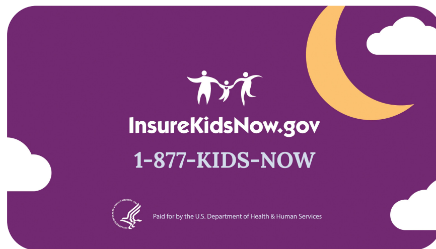
SUPER: InsureKidsNow.gov 1-877-KIDS-NOW Paid for by the U.S. Department of Health & Human Services VO: Learn more at InsureKidsNow.gov. Paid for by the U.S. Department of Health & Human Services.