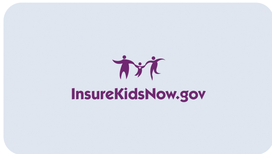
SUPER: InsureKidsNow.gov. Open on the InsureKidsNow.gov logo.