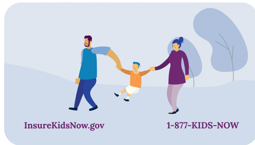
SUPER: InsureKidsNow.gov 1-877-KIDS-NOW Open on a family, mimicking the form of the InsureKidsNow.gov logo, walking outdoors. VO: Medicaid and CHIP offer free or low-cost health coverage for kids and teens.